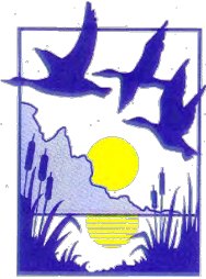
Hamilton-Halton Watershed Stewardship Program

In 2007, the Hamilton-Halton Watershed Stewardship Program (HHWSP) partnered with the staff and students of Brookville Public School to create a 'Living Classroom' of unique ecosystems to enhance the learning experience of its students.